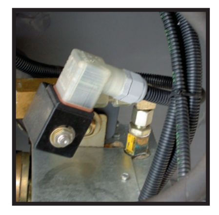
Hirschmann GDM Valve Connectors