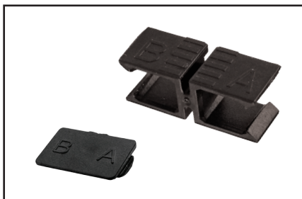
FXBUCLLDB25N and FXBUCLSDB25N Duplex Clips

Hermetically sealed contractor pack ensures connectors remain fresh and contaminate free