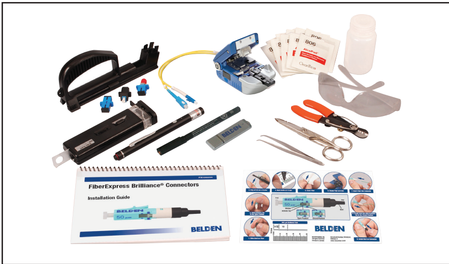
Available Accessories Include: Support handle, VFL, Precision Cleaver, and Fiber Preparation tools.

FiberExpress Brilliance Universal is the industry's leading connector for saving time, labor and material costs.