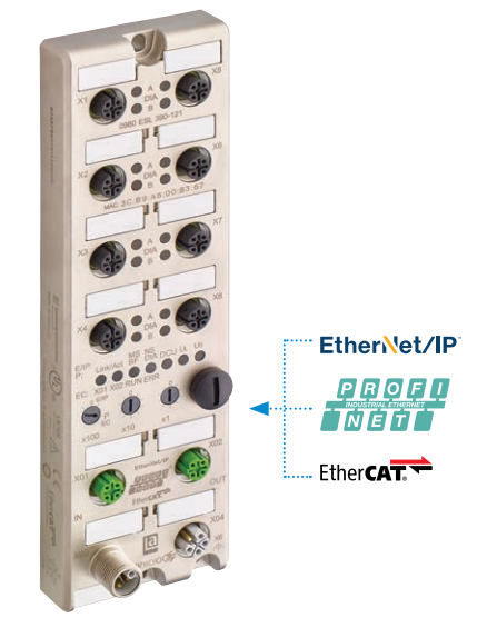
LioN-P, I/O Standalone, Multiprotocol