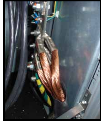
Figure 1. Termination for parallel ground connections on drive.

job site. Added to that, the large bend radius ensures that it is likely impractical to enter the motor junction box from any place other than the top, where any penetrations increase the likelihood of water or oil ingress. And once inside the junction box, the large conductors will be difficult to bend and manipulate into effective terminations. The use of parallel constructions can significantly ease the cable handling difficulties, and reduce the overall cable weight installed in cable trays.